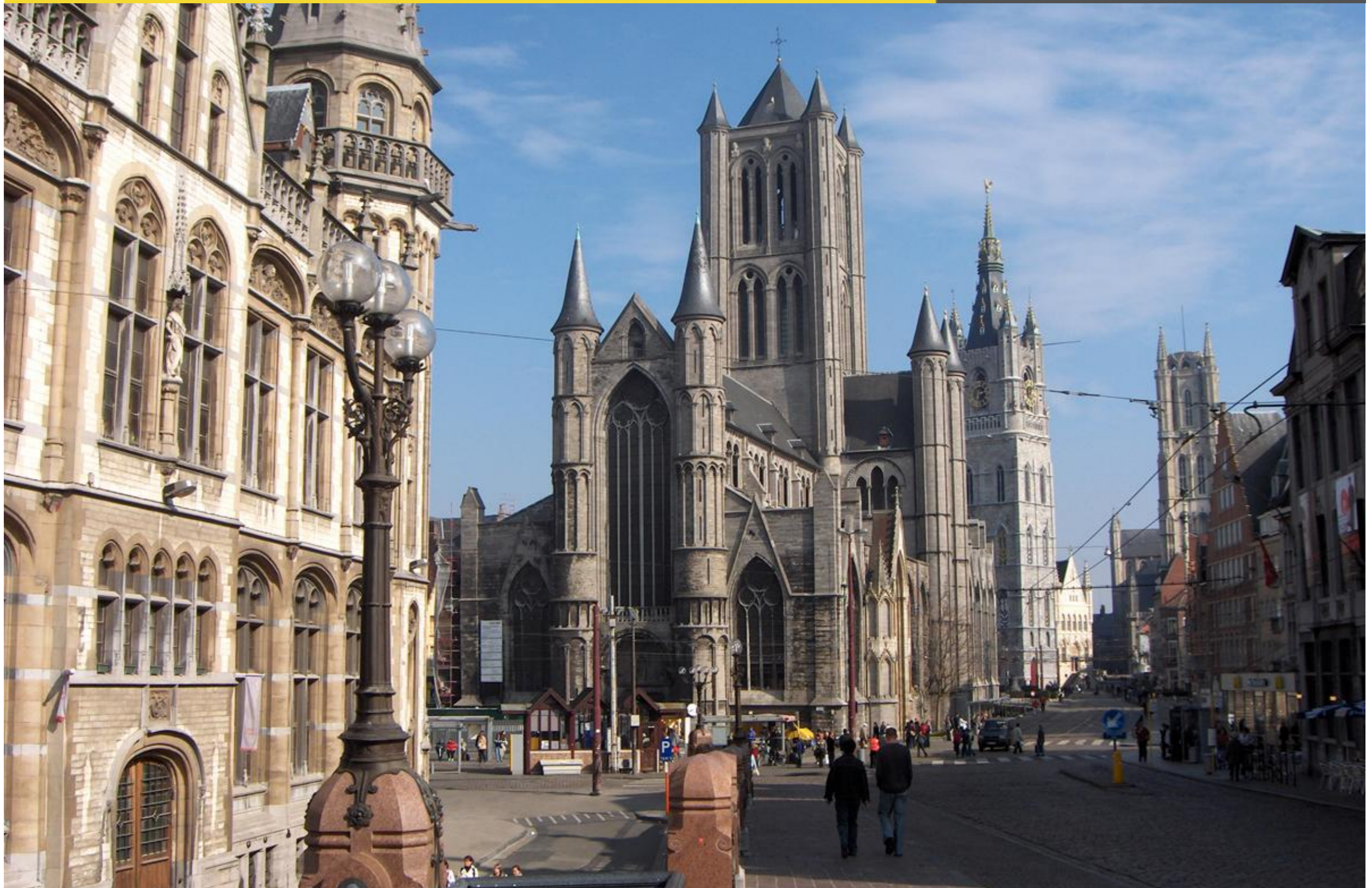
St Nicolas Church (1320) – Belfry (1380) – St Bavo Cathedral (1533)