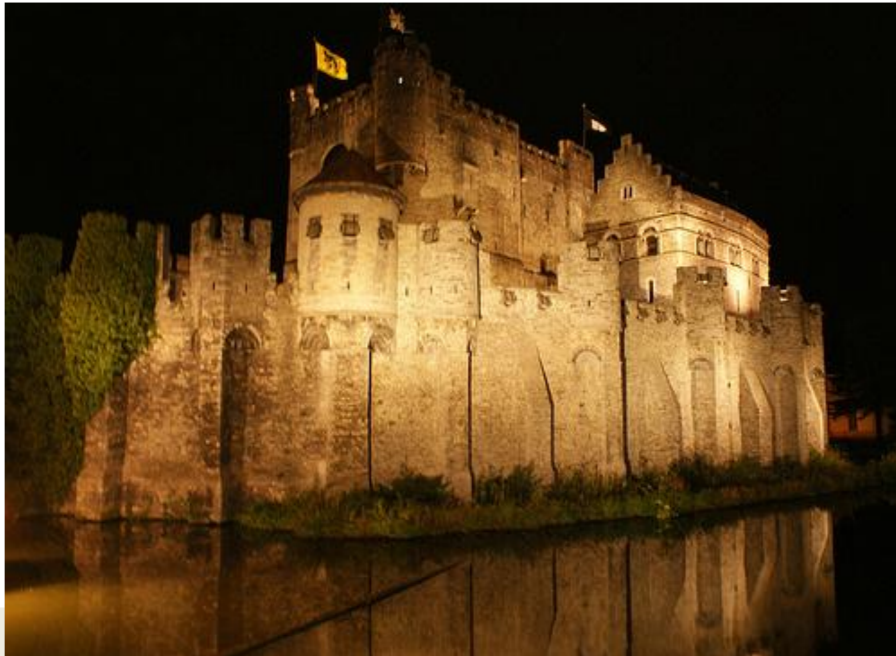
Gravensteen Castle (1093)